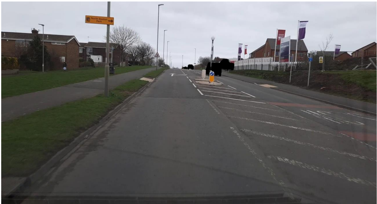
Vaisala image of new pedestrian refuge