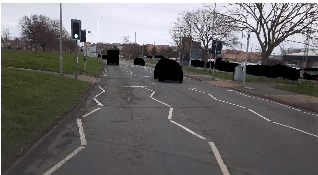
Vaisala image of existing pedestrian crossing near Newbiggin Road / College Road junction

It should be noted that there are several additional crossing points provided on this section of Newbiggin Road, in the form of uncontrolled crossing points as well as a controlled pedestrian crossing to the east of the Newbiggin Road/College Road roundabout junction.